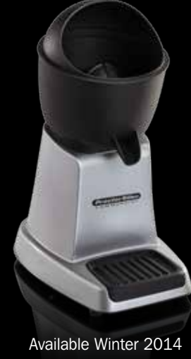
Available Winter 2014

Powers Through Any Juicing Task Quickly Ample Height for Juicing into Tall Cups Juice Bowl & Strainer Remove for Easy Cleaning Heavy-Duty Aluminum Housing