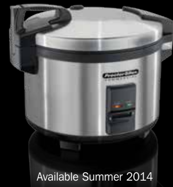
Available Summer 2014

Shifts To Keep Warm After Cooking Easy-To-Clean Nonstick Pot Easy To Open/Close Hinged Lid Cooks White, Brown, and Jasmine Rice Durable Stainless Steel Housing