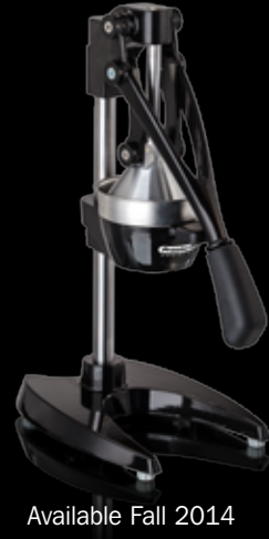
Available Fall 2014

Place It Anywhere Provides Maximum Pressure with Minimal Effort & Strength Ample Height for Juicing into Tall Cups Strainer & Funnel Remove for Easy Cleaning Heavyweight Base for Optimal Stability