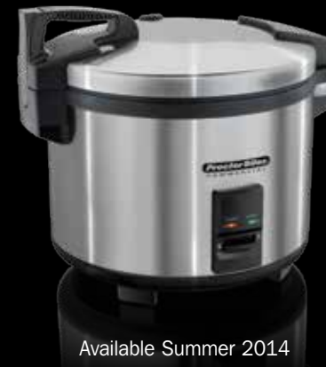
Available Summer 2014

Shifts To Keep Warm After Cooking Easy-To-Clean Nonstick Pot Insulated Double-Wall Construction with Hinged/Heated Lid Cooks Rice, Grits, Oatmeal, Porridge, Mac & Cheese Durable Stainless Steel Housing